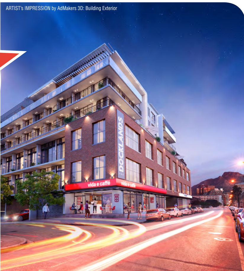
ARTIST'S IMPRESSION by AdMakers 3D: Building Exterior