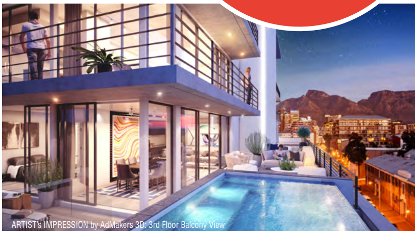
ARTIST'S IMPRESSION by AdMakers 3D: 3rd Floor Balcony View