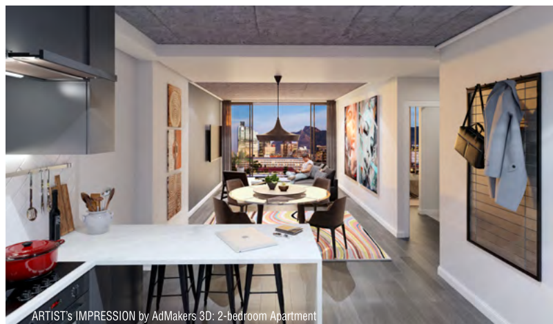
2-bedroom Apartment

How about concerts and sports events? A 15 minute walk and you're at the Cape Town stadium!